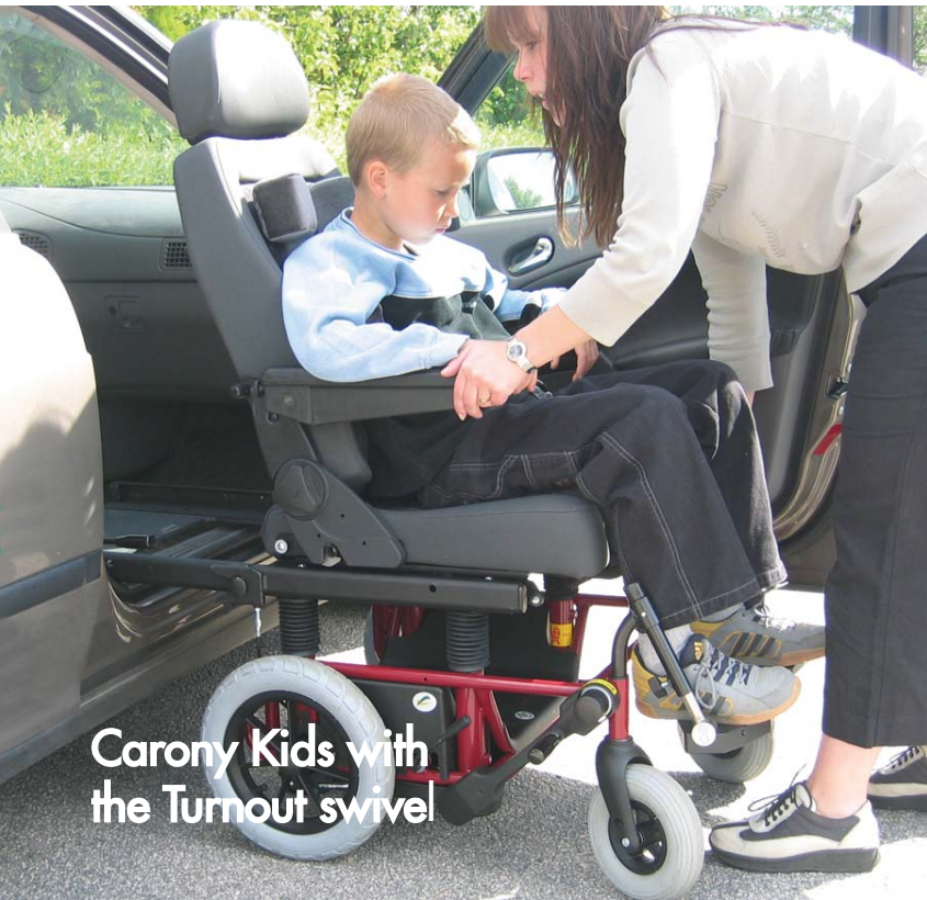
Carony Kids with the Turnout swivel

CARONY Kids does away with having to lift the child and simplifies transport to and from the car. Dock the back of the wheelchair towards the vehicle swivel base and release the seat from the wheel unit. Slide the seat over from the wheelchair rails to the rails of the vehicle swivel base. When the seat has been transferred you just swivel the seat facing towards the front, fasten the seat belt and you are ready to go.