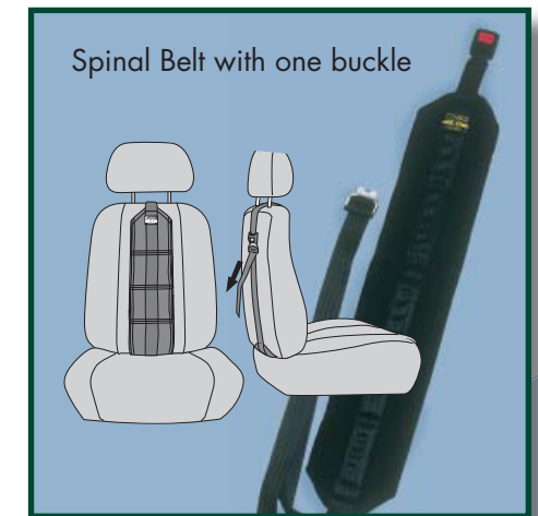
The Spinal Belt is the base on which all the stabilizing belts are fixed.

NB! The belt system should always be used together with the vehicle standard seatbelt!